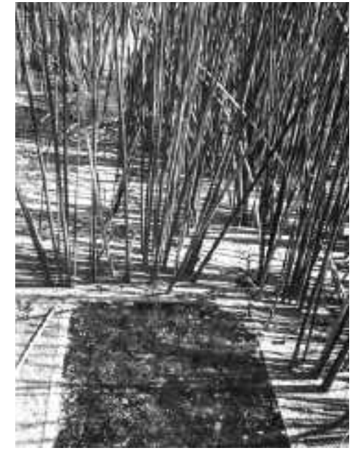
Fig 4.4: Stands of Schoenaoplectus with duckweed on the surface and Ceratophyllum beneath provide a high nutrient removal capacity

section of highly productive duckweed with larger biomass emergent macrophytes did not affect the nutrient uptake capacity of the wetland system. This study however has demonstrated that nutrient removal by wetland plants is maximised by maintaining a variety of macrophyte types and species.