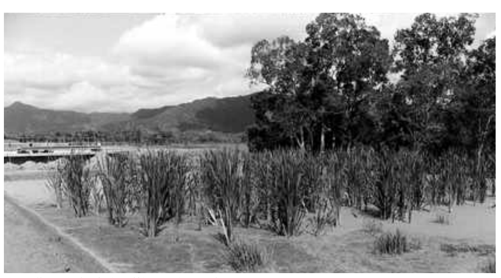
Fig 4.2: Changes in plant density and biomass - after 3 months