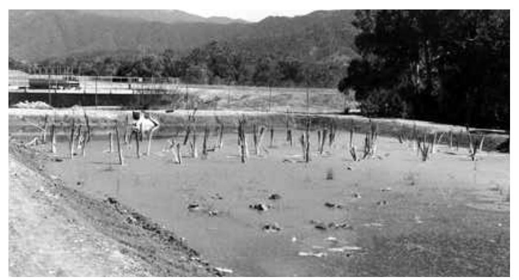
Fig 4.1: Changes in plant density and biomass - initial planting