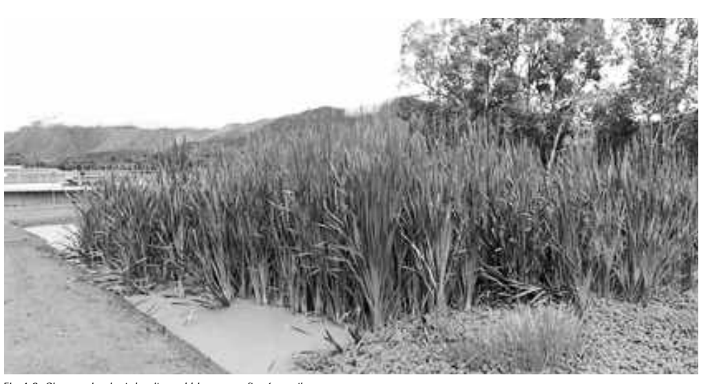
Fig 4.3: Changes in plant density and biomass - after 6 months

PLEASE CONTACT Virginia Verrelli on tel 03 9905 2704 or email virginia.verrelli@eng.monash.edu.au