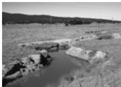
Goulburn, NSW.