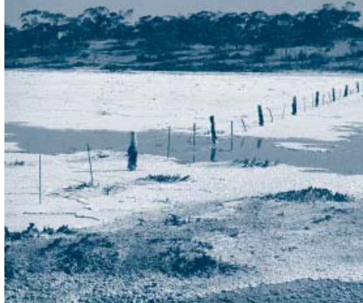
Salinisation is a major national problem.

The National Land and Water Audit has given us a national survey of waterway condition throughout most of the agricultural and urban areas of Australia. It shows widespread damage to our river systems 3 . Most States have now identified some rivers that are relatively undamaged, and recognised the importance of protecting them from further development, but at this stage the legislative means for giving ongoing protection is weak.