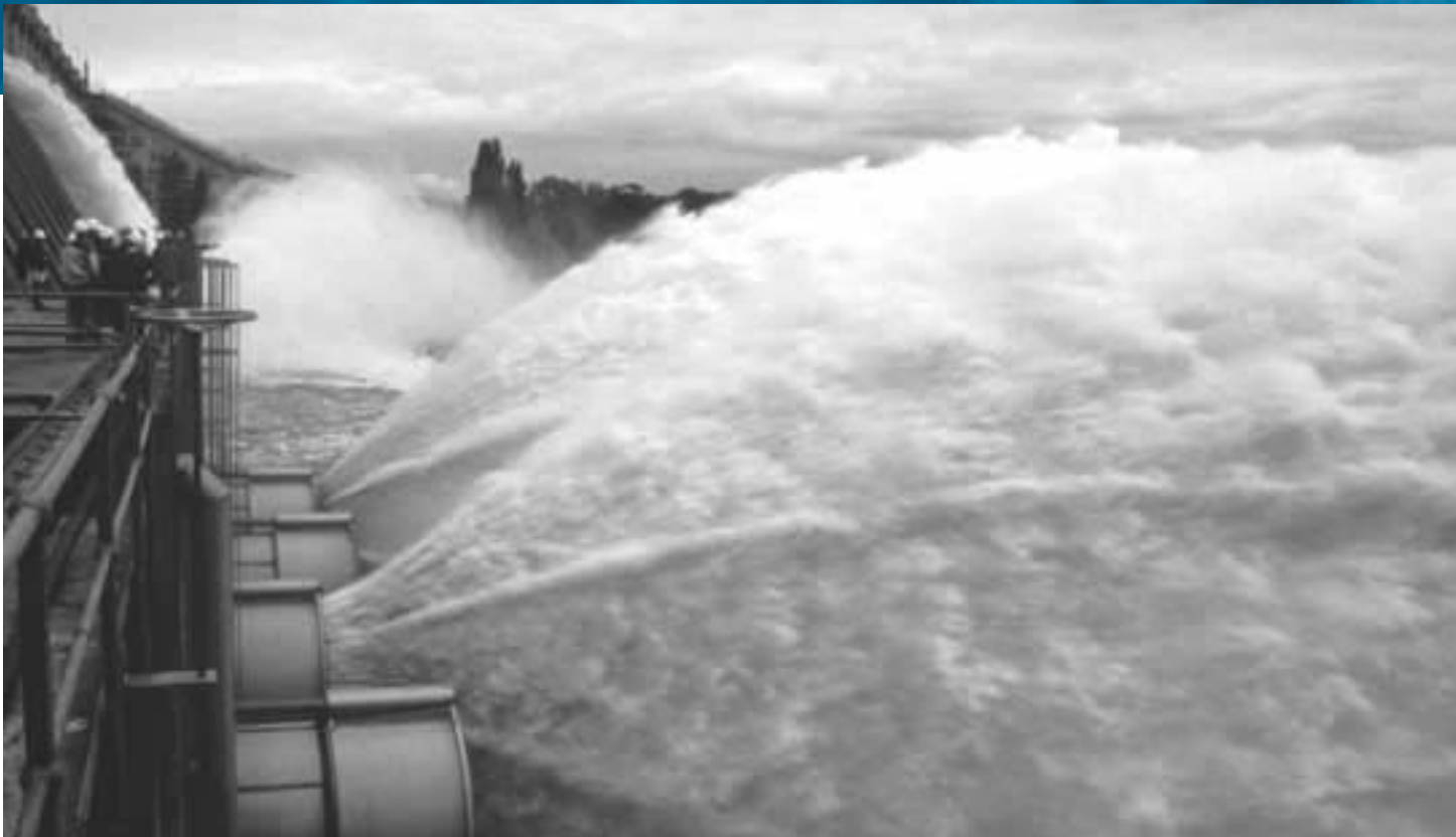
Water release from Hume Dam. Cold water releases from the bottom of dams pose a major threat to native fish. In some rivers, the shock of the released cold water not only slows the fish's growth, but can stop fish breeding, leading to local extinctions.

species in NSW, 28 undertake large-scale migrations and 16 migrate on local scales 8 . There are over 4,300 physical barriers to fish migration on NSW waterways, and some 26 effective fishways.