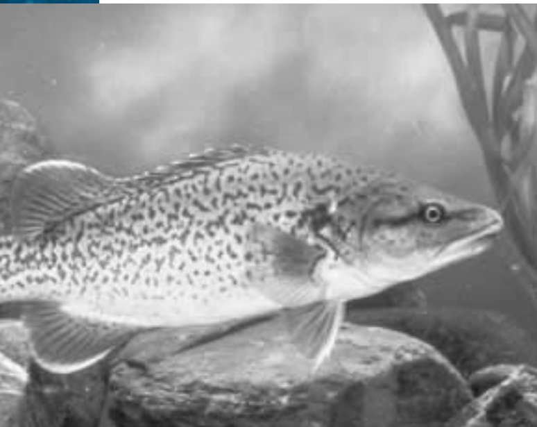
The Trout cod, an endangered Australian native fish. Machullochella maquariensis . Twenty-one of Australia's native fish species are endangered or vulnerable.