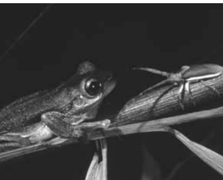
Frog meets insect, part of the intricate food web supported by freshwater habitats.

A Heritage River System to protect the few undamaged rivers is necessary, but is no substitute for smarter and more sustainable management of land and water across the entire landscape.