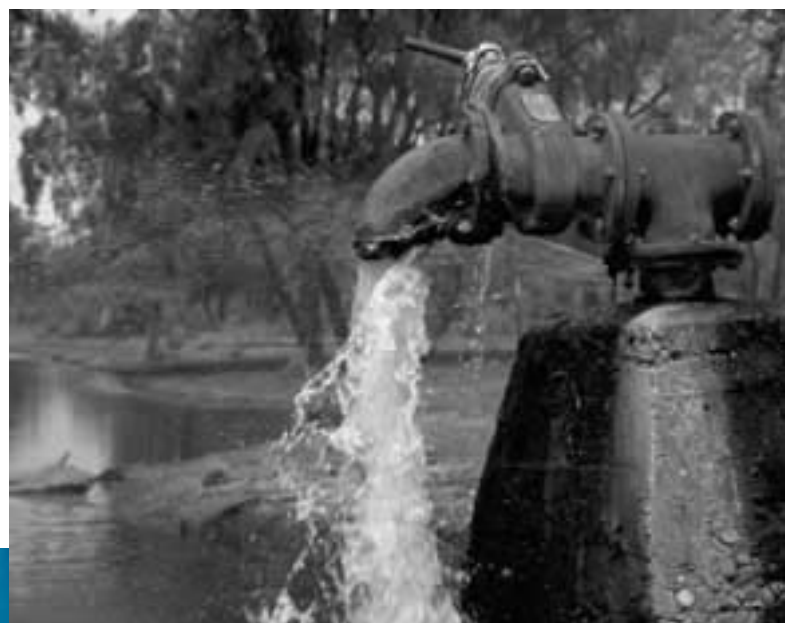
Healthy river systems provide a variety of 'ecosystem services', including fresh water for domestic supply, irrigation and other purposes.

Paul Ehrlich provided an analogy between losing biodiversity and losing rivets in an aeroplane wing. Imagine you are about to board an aeroplane. As you are approaching the aeroplane, you see a worker removing rivets from the aircraft wing....We can lose a certain number of rivets and the aircraft will keep flying; lose more and it may crash. Once