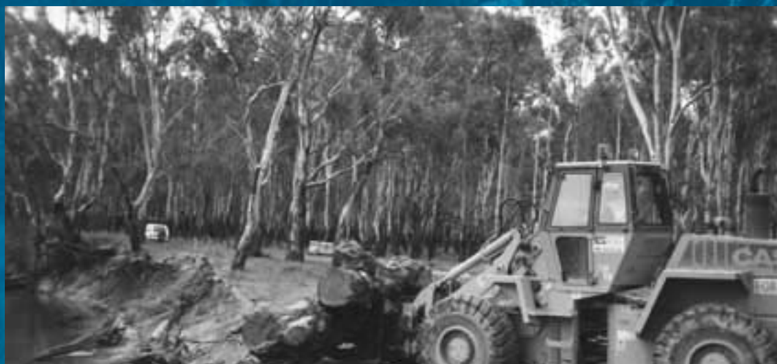
Replacing snags can provide valuable habitat for native fish and other river animals.

Victoria does have a Heritage River Act (1992) but has so far largely failed to implement it 11 . New South Wales also has a capacity to establish freshwater reserves under its Fisheries Management Act (1994), but has chosen not to do so 9 . The other States can identify undamaged rivers in their water plans and can designate them not to be developed, but this protection is currently limited and could be changed relatively easily.