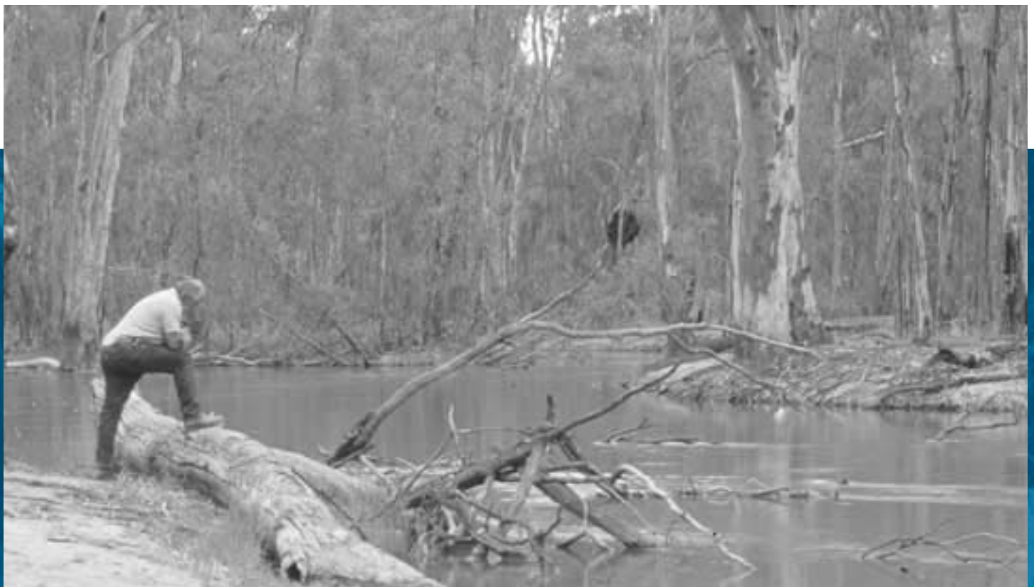
Overlooking a branch of the Edward River, Millewa Forest.

Regional catchment organisations could initiate working with State and Federal agencies to identify their freshwater ecosystems that are still relatively natural and intact. They need to ensure that at least a representative sample of such rivers is protected. In view of the degradation, this really means identifying any remaining undamaged rivers and ensuring appropriate management of the entire upstream catchment protects them. If this is not done adequately such plans may not achieve accreditation for funding.