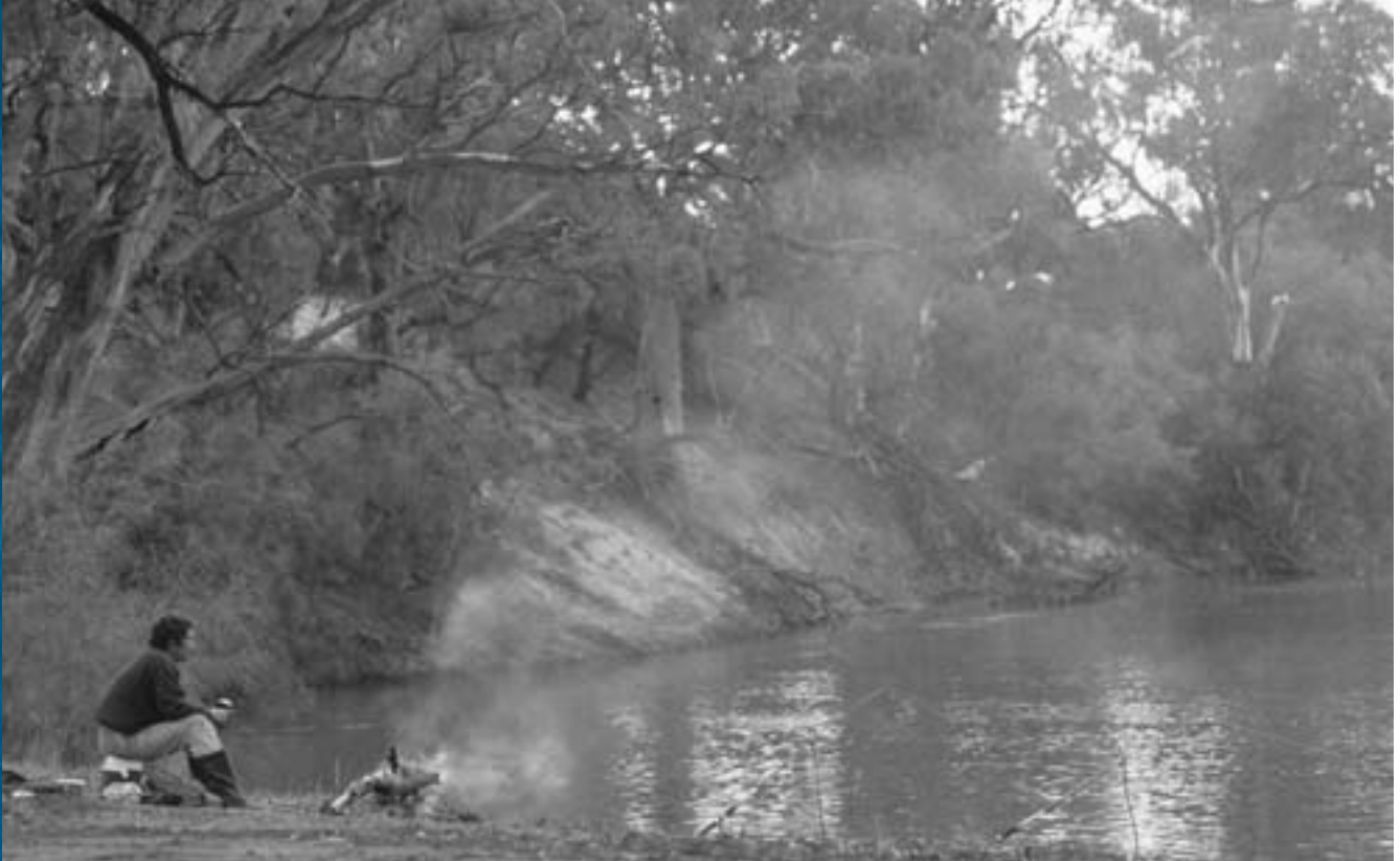
Citrus worker camped on River Murray near Colignan, NW Victoria.

For further information or to receive the Centre's free newsletter, WaterShed, contact: