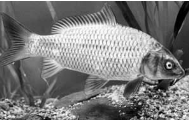
Carp, introduced to Australia in the 1850s, are now our most abundant large freshwater fish. They are favoured by constant water levels. ( Cyprinus carpio ).

Australia has inadequate controls over exotic aquarium fish. Many exotic species are imported from Asia and fish and plants used in aquaria are often released into waterways, and sometimes establish pest populations. The Oriental Weather-loach seems to have been introduced to streams around Sydney, Canberra and Melbourne in this fashion.