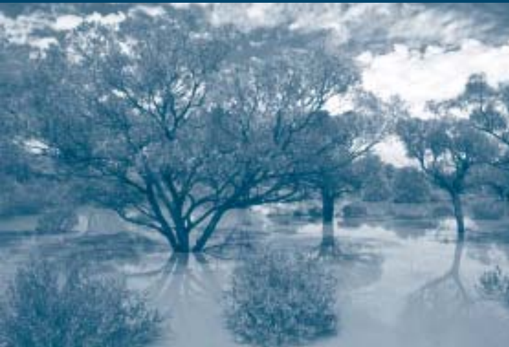
Cooper Creek floodplain. The need for connections between rivers and their floodplains is now appreciated. During high flows, rivers are seeded with biological material from their floodplains.