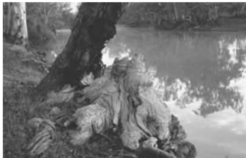
The Lindsay River, a healthy anabranch of the Murray, west of Mildura.

These catchment authorities provide a forum for the diverse interests that seek to use our waterways for extractive and other uses. In many situations they are the conduit by which State and Federal funding is being delivered to provide for on-ground works to improve catchment and river health. Given the variety of factors that lead to a loss in freshwater biodiversity, these organisations face a range of ways they can intervene if they wish to achieve some positive biodiversity outcomes.