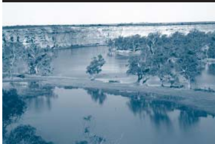
The River Murray, a highly regulated river system.

In NSW 25% of the species expected to occur were not found in the recent NSW Fish Survey, indicating the poor condition of many waterways, especially those in the Murray-Darling Basin 8 . Eight freshwater fish species are listed under NSW legislation as threatened, with others pending. Eleven alien species have been recorded in NSW