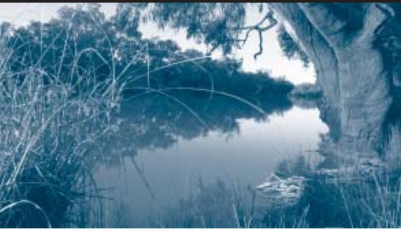
Relatively undamaged rivers like the Paroo River provide important benchmarks to compare more modified rivers with.

Australia's rivers and wetland systems contain unique plants and animals that are adapted to the varied riverflows.