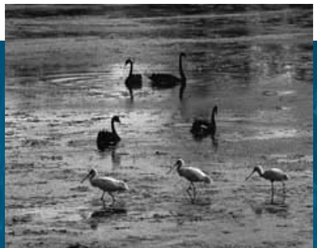
Black swans and yellow-billed spoonbills in a lower Murray wetland, Mannum, SA. The long-term survival of wetland bird populations depends on the timing and duration of floods. Some waterbirds may abandon their nests if floodwaters recede too quickly.

A central part of this assessment process requires us to have undamaged reference areas set aside and managed effectively so that we have something to compare treated areas with. There are very few such rivers left in the agricultural regions of Australia.