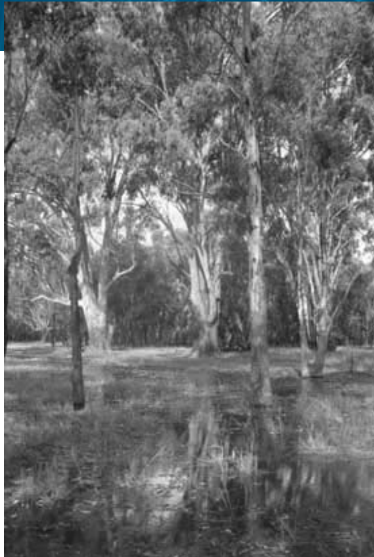
The Barmah-Millewa Redgum Forest in flood, a priority conservation area.

Each jurisdiction in its water planning has identified rivers of conservation value, and they are seeking to protect them from further development. The Paroo River and Coopers Creek are examples in Queensland; the Ovens and Mitchell in Victoria. Other important and relatively undamaged rivers worthy of attention include the East Alligator in Northern Territory, the Clarence in New South Wales and the Fitzroy in Western Australia. The Barmah-Millewa wetlands are also recognised as priority conservation areas.