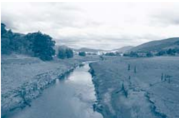
Poor riverbank vegetation and eroded banks. Goodradigbee River at Wee Jasper, NSW.

Levee banks – Levees have been constructed to protect areas from flooding, but have served to disconnect the river