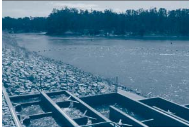
A fish ladder on Torrumbarry Weir. Installing fish ladders on dams and weirs assists fish movement along a river system.

There has been no comprehensive effort to identify important freshwater areas and to establish reserves to ensure their survival 11 . Even the streams that happen to be in protected land areas are not protected from all threatening processes. Sewage effluent is discharged into streams in our alpine national parks, salt may be applied to roads, water is extracted for resort use and for activities such as snow making. Introduced fish are treated as a major recreational resource rather than a threat to native biota. In Kosciusko National Park all but one river is dammed or has water diverted by aqueducts.