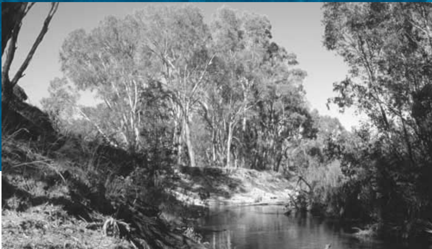
The relatively unregulated Broken River, Victoria. A healthy river maintains the connections between the river, floodplain and Wetlands.