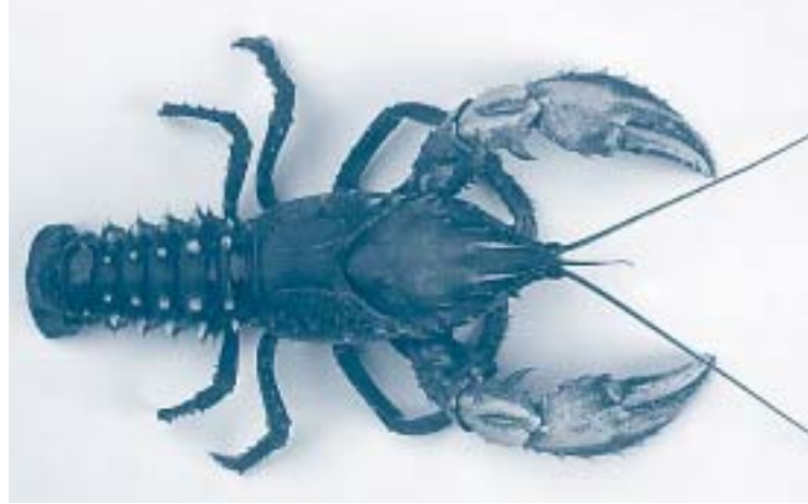
Once abundant throughout the Murray and Murrumbidgee Rivers, the River Murray crayfish is now uncommon in the lower Murray system.