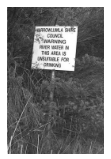
Warning!