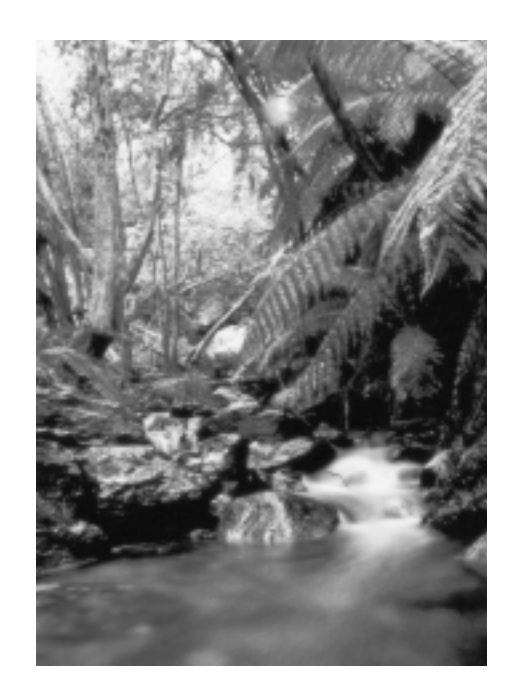
A reference site for the AUSRIVAS model.