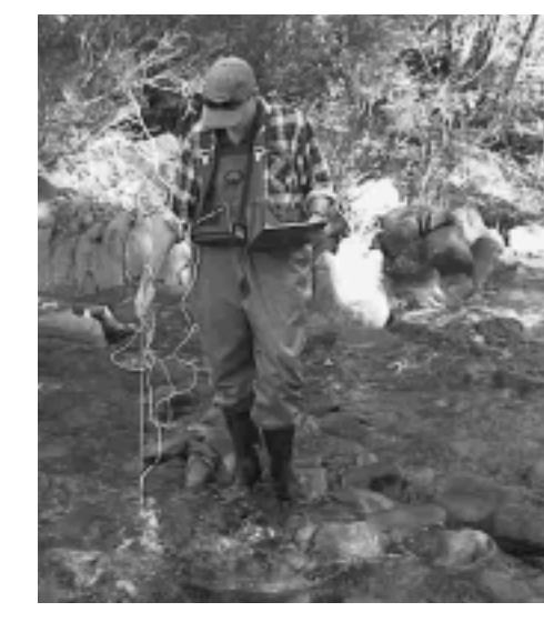
Measuring stream velocity using a flow meter for the First National Assessment of River Health.