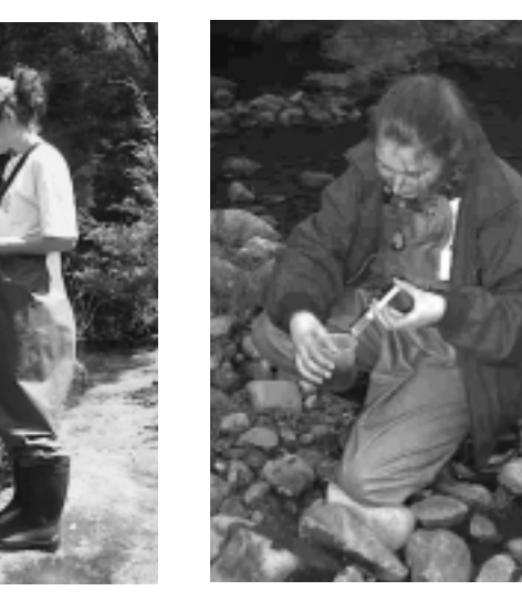
Measuring stream velocity for assessing river health using the AUSRIVAS model.

AUSRIVAS models and their application continued, with their inclusion in a statewide assessment using the Index of Stream Condition in Victoria, and interest in its use shown by Indonesia and New Zealand. The Centre continued to provide training in the use of AUSRIVAS across Australia and is developing training workshops and materials for agency personnel. The Centre has also liaised with the lead agencies responsible for AUSRIVAS in each state to finalise models for the AUSRIVAS internet site. These models will be widely available for the assessment of river condition around Australia.