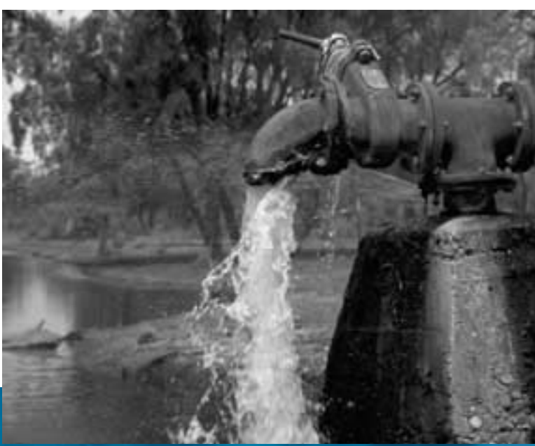
Healthy river systems provide a variety of 'ecosystem services', including fresh water for domestic supply, irrigation and other purposes.

Paul Ehrlich provided an analogy between losing biodiversity and losing rivets in an aeroplane wing. Imagine you are about to board an aeroplane. As you are approaching the aeroplane, you see a worker removing rivets from the aircraft wing.....We can lose a certain number of rivets and the aircraft will keep flying; lose more and it may crash. Once