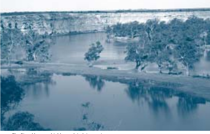
The River Murray, a highly regulated river system.

inland waters, most again in the highly regulated Murray-Darling Basin.