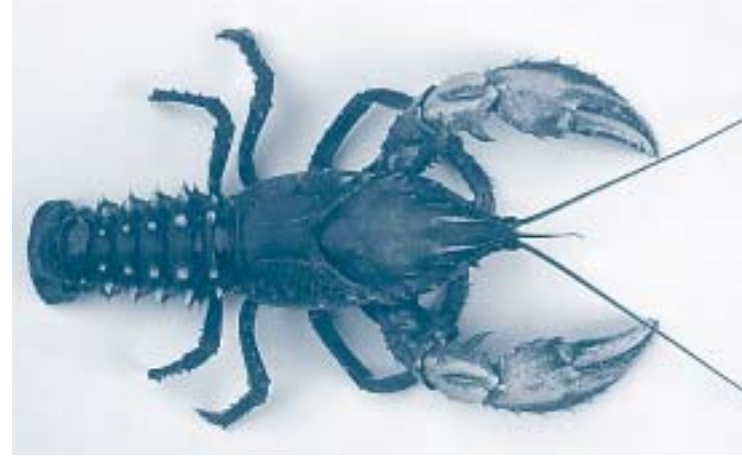
Once abundant throughout the Murray and Murrumbidgee Rivers, the River Murray crayfish is now uncommon in the lower Murray system.