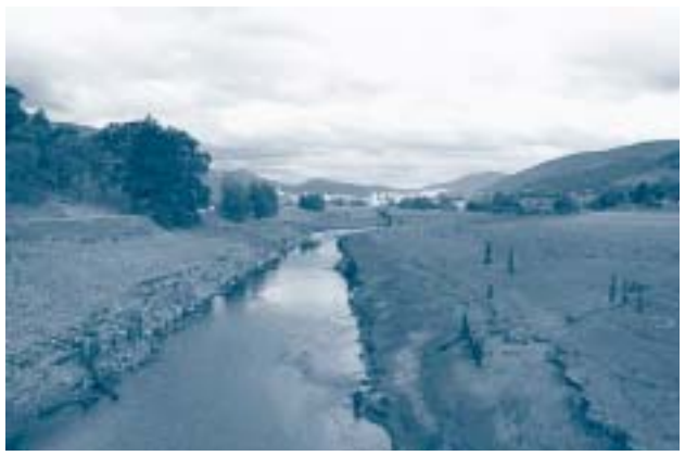
Poor riverbank vegetation and eroded banks. Goodradigbee River at Wee Jasper, NSW.

Levee banks – Levees have been constructed to protect areas from flooding, but have served to disconnect the river