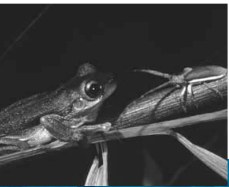
Frog meets insect, part of the intricate food web supported by freshwater habitats.

Each jurisdiction in its water planning has identified rivers of conservation value, and they are seeking to protect them from further development. The Paroo River and Coopers Creek are examples in Queensland; the Ovens and Mitchell in Victoria. Other important and relatively undamaged rivers worthy of attention include the East Alligator in Northern Territory, the Clarence in New South Wales and the Fitzroy in Western Australia. The Barmah-Millewa wetlands are also recognised as priority conservation areas.