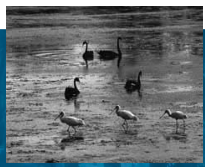
Black swans and yellow-billed spoonbills in a lower Murray wetland, Mannum, SA. The long-term survival of wetland bird populations depends on the timing and duration of floods. Some waterbirds may abandon their nests if floodwaters recede too quickly.

A central part of this assessment process requires us to have undamaged reference areas set aside and managed effectively so that we have something to compare treated areas with. There are very few such rivers left in the agricultural regions of Australia.