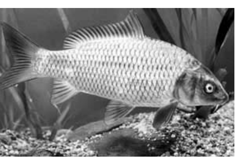
Carp, introduced to Australia in the 1850s, are now our most abundant large freshwater fish. They are favoured by constant water levels. (Cyprinus carpio).

Australia has inadequate controls over exotic aquarium fish. Many exotic species are imported from Asia and fish and plants used in aquaria are often released into waterways, and sometimes establish pest populations. The Oriental Weather-loach seems to have been introduced to streams around Sydney, Canberra and Melbourne in this fashion.