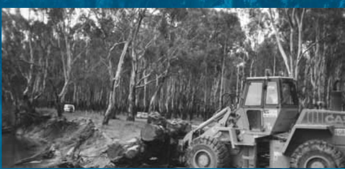
Replacing snags can provide valuable habitat for native fish and other river animals.

Victoria does have a Heritage River Act (1992) but has so far largely failed to implement it. New South Wales also has a capacity to establish freshwater freshwater reserves under its Fisheries Management Act (1994), but has chosen not to do so. The other States can identify undamaged rivers in their water plans and can designate them not to be developed, but this protection is currently limited and could be changed relatively easily.