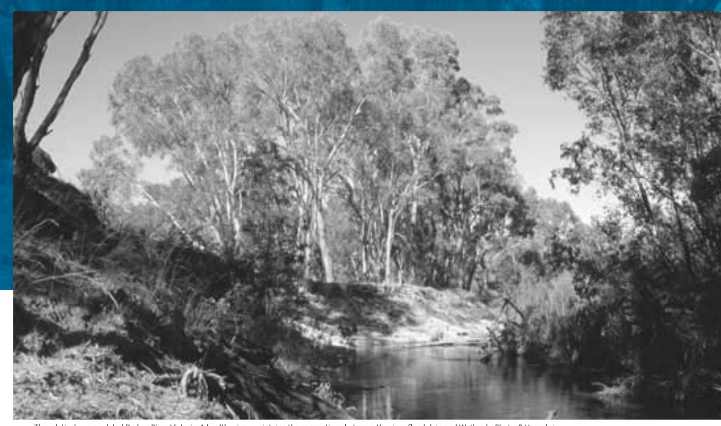
The relatively unregulated Broken River, Victoria. A healthy river maintains the connections between the river, floodplain and Wetlands.