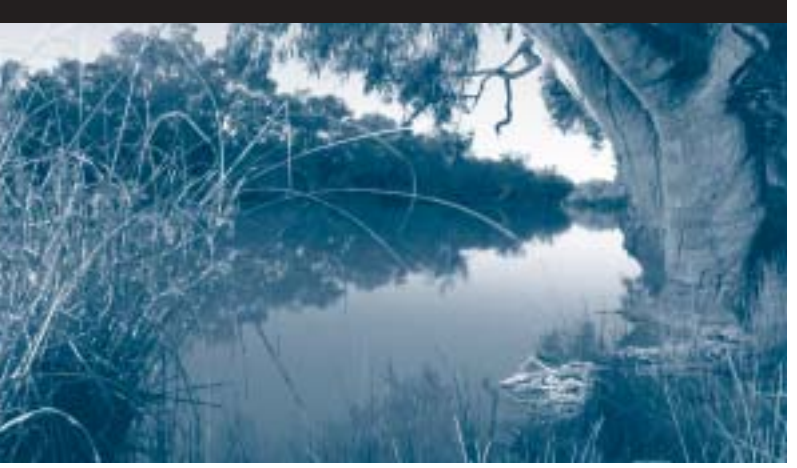
Relatively undamaged rivers like the Paroo River provide important benchmarks to compare more modified rivers with.

Australia's rivers and wetland systems contain unique plants and animals that are adapted to the varied riverflows.