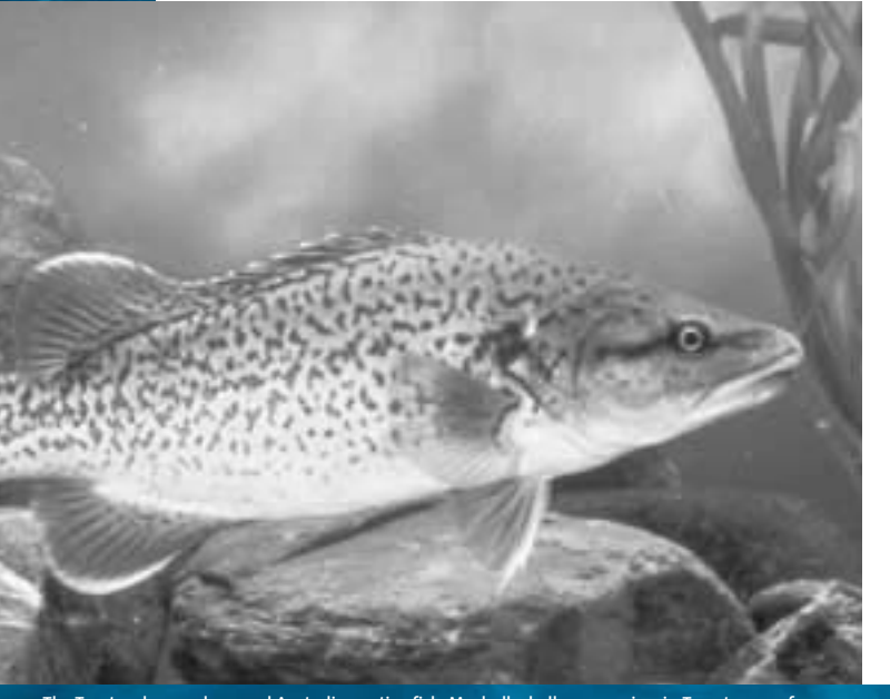
The Trout cod, an endangered Australian native fish. Machullochella maquariensis. Twenty-one o Australia's native fish species are endangered or vulnerable.

In NSW 25% of the species expected to occur were not found in the recent NSW Fish Survey, indicating the poor condition of many waterways, especially those in the Murray-Darling Basin<sup>8</sup>. Eight freshwater fish species are listed under NSW legislation as threatened, with others pending. Eleven alien species have been recorded in NSW