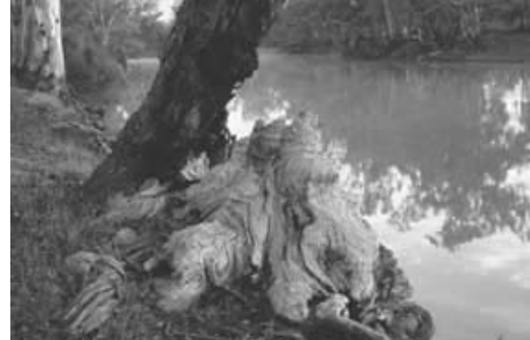
The Lindsay River, a healthy anabranch of the Murray, west of Mildura.

These catchment authorities provide a forum for the diverse interests that seek to use our waterways for extractive and other uses. In many situations they are the conduit by which State and Federal funding is being delivered to provide for on-ground works to improve catchment and river health. Given the variety of factors that lead to a loss in freshwater biodiversity, these organisations face a range of ways they can intervene if they wish to achieve some positive biodiversity outcomes.