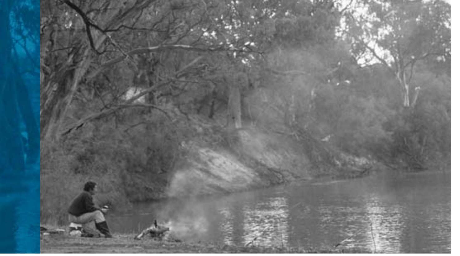
Citrus worker camped on River Murray near Colignan, NW Victoria.

For further information or to receive the Centre's free newsletter, WaterShed, contact: