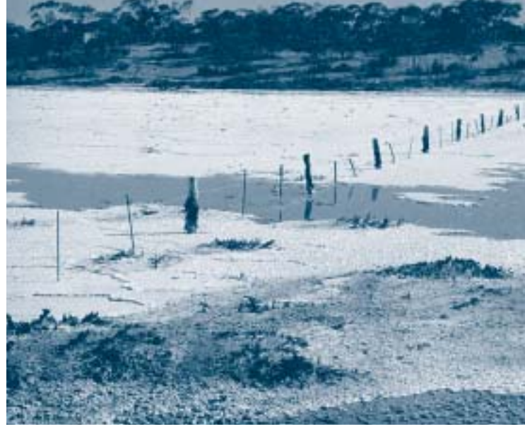
Salinisation is a major national problem

The National Land and Water Audit has given us a national survey of waterway condition throughout most of the agricultural and urban areas of Australia. It shows widespread damage to our river systems<sup>3</sup>. Most States have now identified some rivers that are relatively undamaged, and recognised the importance of protecting them from further development, but at this stage the legislative means for giving ongoing protection is weak.