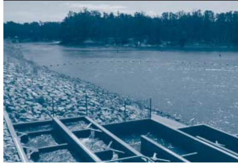
A fish ladder on Torrumbarry Weir. Installing fish ladders on dams and weirs assists fish movement along a river system.

There has been no comprehensive effort to identify important freshwater areas and to establish reserves to ensure their survival". Even the streams that happen to be in protected land areas are not protected from all threatening processes. Sewage effluent is discharged into streams in our alpine national parks, salt may be applied to roads, water is extracted for resort use and for activities such as snow making. Introduced fish are treated as a major recreational resource rather than a threat to native biota. In Kosciusko National Park all but one river is dammed or has water diverted by aquaducts.