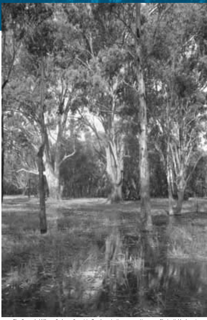
The Barmah-Millewa Redgum Forest in flood, a priority conservation area.

This sort of integrated treatment of an intact river is only possible through some form of Integrated Catchment Management strategy and organisation. States have generally failed to appoint a "river manager" responsible for the health of the rivers, and we have a variety of agencies in competition with each other to sell irrigation water, to reduce pollution, to promote agriculture and to manage fisheries. Integration of these various interests has largely been impossible, even in the conglomerate natural resource agencies that have been established in some States.