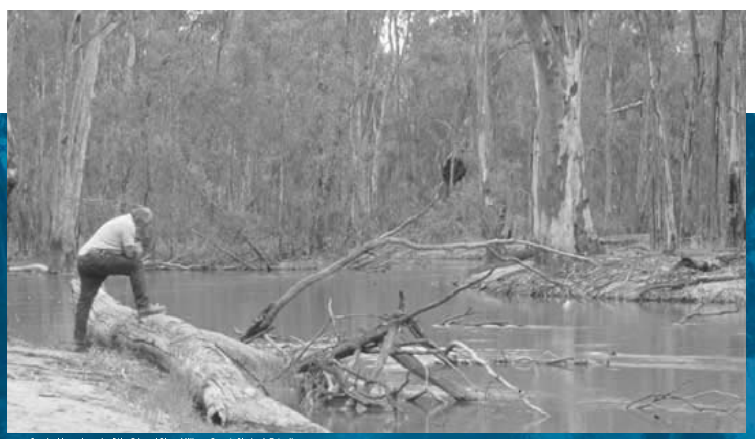
Overlooking a branch of the Edward River, Millewa Forest.

Regional catchment organisations could initiate working with State and Federal agencies to identify their freshwater ecosystems that are still relatively natural and intact. They need to ensure that at least a representative sample of such rivers is protected. In view of the degradation, this really means identifying any remaining undamaged rivers and ensuring appropriate management of the entire upstream catchment protects them. If this is not done adequately such plans may not achieve accreditation for funding.