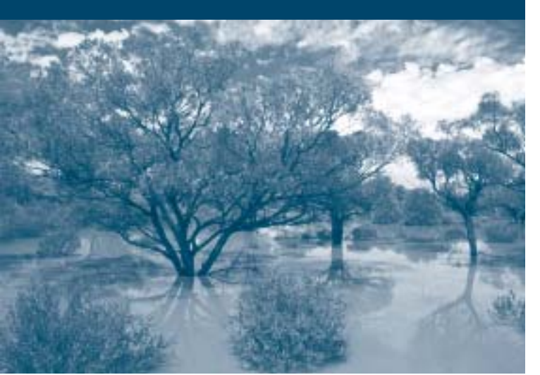
Cooper Creek floodplain. The need for connections between rivers and their floodplains is now appreciated. During high flows, rivers are seeded with biological material from their floodplains