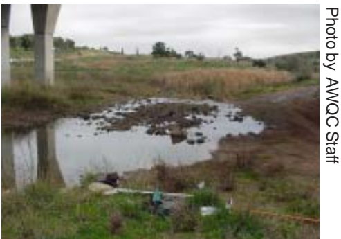
Field River - an ephemeral river in South Australia.