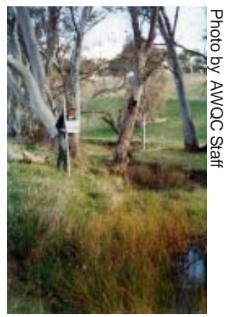
Skillogallee Creek - an ephemeral stream in South Australia