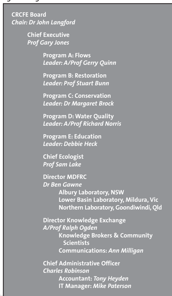
Figure 1: Organisational Structure

The research staff of the CRCFE are almost all provided by the five university partners (Adelaide, Canberra, Griffith, La Trobe, Monash) at labs in Adelaide, Albury, Brisbane, Goondiwindi and Melbourne. Other research staff are provided by CSIRO Land & Water through the Murray-Darling Freshwater Research Centre laboratories at Albury and Mildura, and state water agencies at Armidale and Goondiwindi. Staff and students at these laboratories work within any or several of the four research programs, according to expertise. See chapter 2 for details of the research programs.