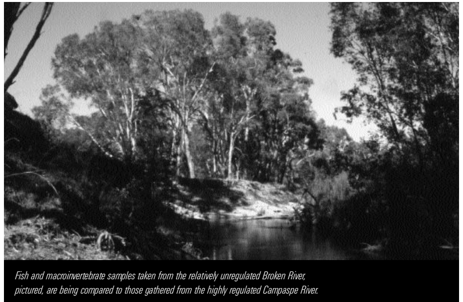
Fish and macroinvertebrate samples taken from the relatively unregulated Broken River, pictured, are being compared to those gathered from the highly regulated Campaspe River.

“We acknowledge that there have been many other changes to our river systems, such as loss of habitat, land clearing, salinisation, eutrophication, introduction of exotic species and over-fishing,” he said.