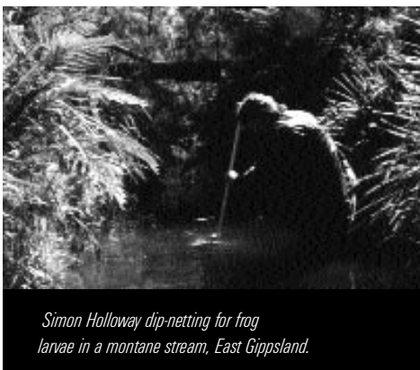
Simon Holloway dip-netting for frog larvae in a montane stream, East Gippsland.