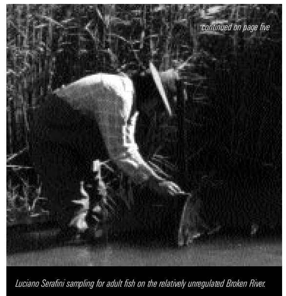
Luciano Serafini sampling for adult fish on the relatively unregulated Broken River.