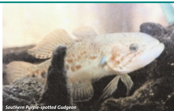
Southern Purple-spotted Gudgeon