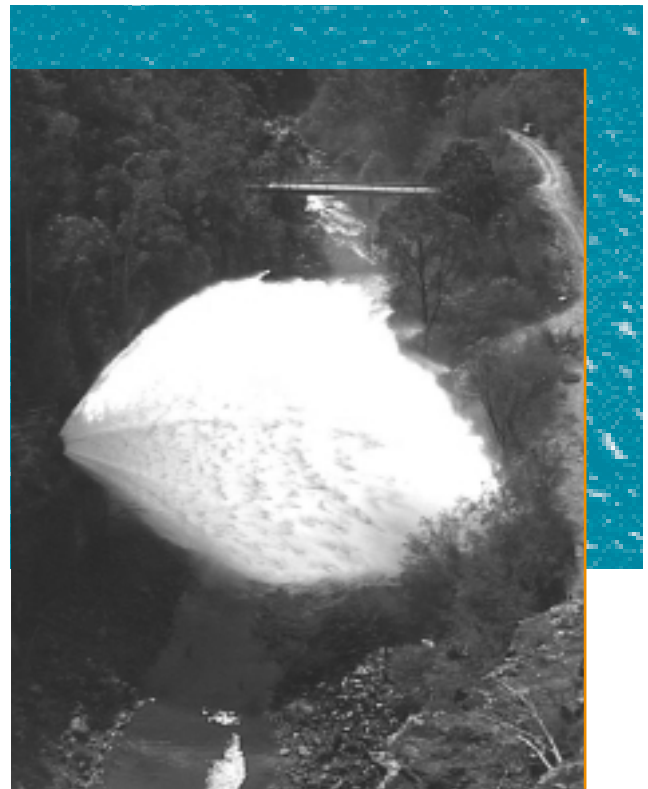
A release of water from Bendora Reservoir for environmental flow. Cotter River, ACT.