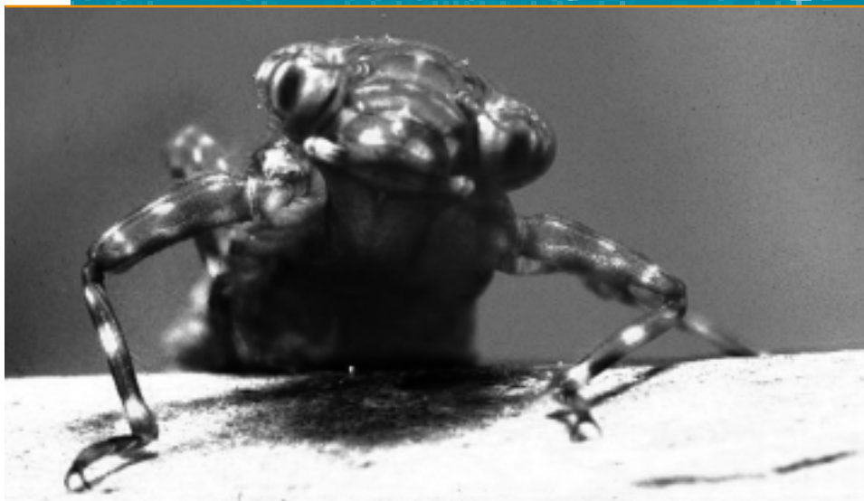
Dragonfly larvae, an aquatic invertebrate.