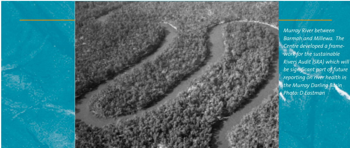
Murray River between Barmah and Millewa. The Centre developed a framework for the sustainable Rivers Audit (SRA) which will be significant part of future reporting on river health in the Murray Darling Basin

The CRC provided expertise through various committees, workshops, seminars and presentations for over eighty industry users and other organisations. Many CRC staff have provided expertise and recommendations for expert panels on water issues including: