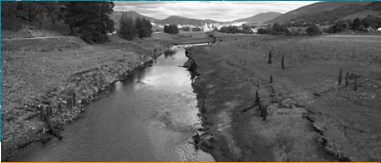
Poor riparian habitat, Goodradigbee River at Wee Jasper, NSW.

Another important part of Program D are small studies designed to provide a summary of the literature, or to test ideas that might lead to fruitful future research. Four projects are in this category: