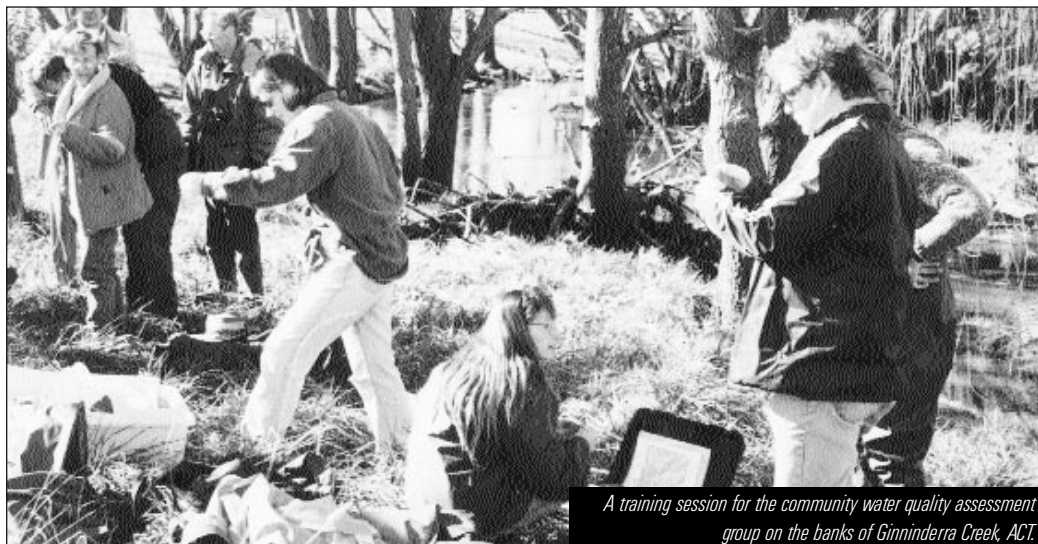
A training session for the community water quality assessment group on the banks of Ginninderra Creek, ACT.