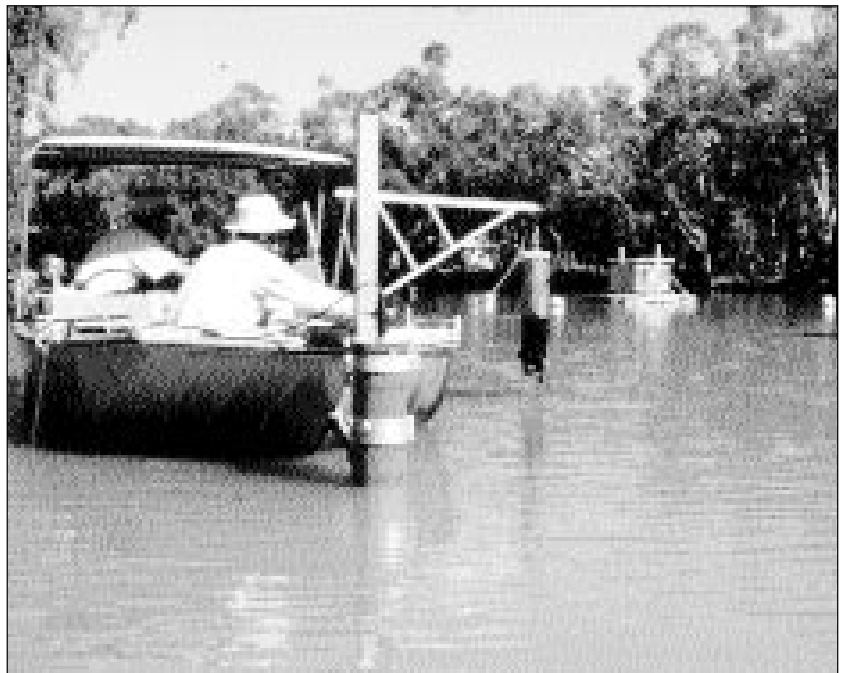
Dr Bradford Sherman and Mr Garry Miller, of the CSIRO Centre for Environmental Mechanics, take measurements near Maude Weir on the Murrumbidgee River.

The research team evaluated four different strategies to manipulate the physical conditions within the weir pool to prevent algal blooms developing. These were by: maintaining an elevated discharge through the weir (between 500 and 1000 megalitres per day), pulsing the weir discharge (increase from 350 to 1500 megalitres per day every three days), releasing water over the weir gate rather than under it, and artificial destratification. The research team also observed that drawing water for human consumption at deep levels of the weir pool reduced the concentrations of algae in the water supply.